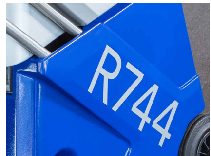
CO 2 is a natural and environmentally sustainable coolant