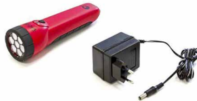
Rechargeable UV lamp: GE7448