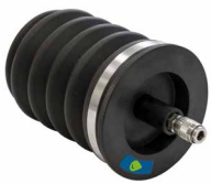
Hermetically-sealed oil container for fresh and waste oil and UV leak detector fluid