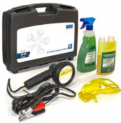
Air conditioning UV leak detection set: GE7428