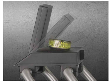
VAS 581 009 for the technology of tomorrow