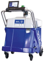
AVL DiTEST ADS 310