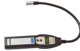
H 2 gas sniffer