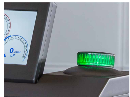
Unique operation system with adjustable display and rotary control with coloured indicators